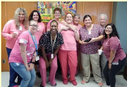
Team members & residents wore pink every Friday in the month of October to raise awareness of Breast Cancer. (above)