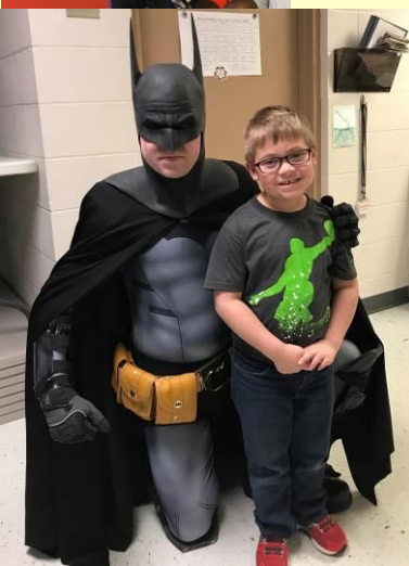
Byron Health Center hosted the Eggstravaganza Community Easter Egg Hunt indoors for the first for area children to enjoy. (above) Area children enjoyed a visit from the Hoosier Batman as well as face painting. (below)

Prior to the actual Easter Egg Hunt, booths were set up in the Eakin Family Room with snacks and activities for all to enjoy included Easter arts & crafts, plant-a-seed and other fun opportunities, like face painting. Byron